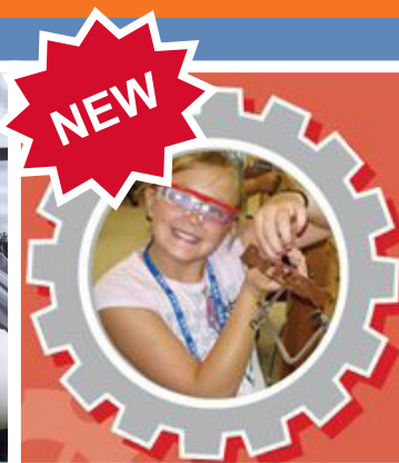
Nuts, Bolts & Thingamajigs Manufacturing Camp