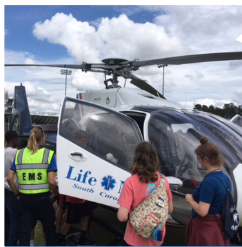
Heroes Among Us Public Service Camp